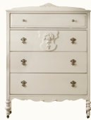
Lisette Tall Dresser