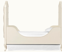
Colette Crib as Toddler Bed