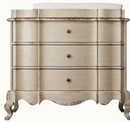
Dresser & Topper (Topper optional)