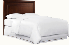
Conversion Crib as Full-Size Headboard