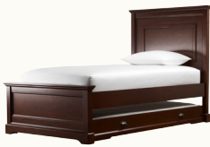
Panel Bed with Low Footboard (Shown with Trundle)