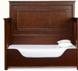
Conversion Crib as Toddler Bed