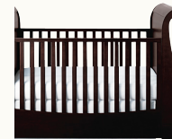
Dresser & Classic Topper (Topper optional)