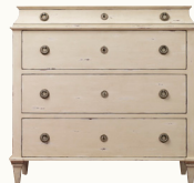
Dresser & Drawer Hutch (Drawer Hutch optional)