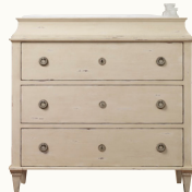
Dresser & Topper (Topper optional)