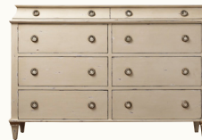
Wide Dresser & Drawer Hutch (Drawer Hutch optional)