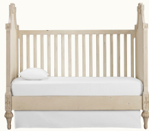
Crib as Toddler Bed