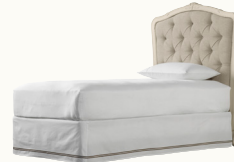
Colette Tufted Headboard