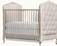
Colette Tufted Crib