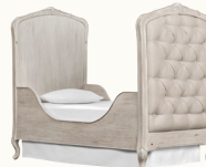
Colette Tufted Crib as Toddler Bed